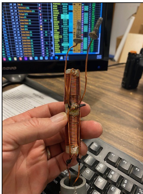
Burned coil from OCF dipole