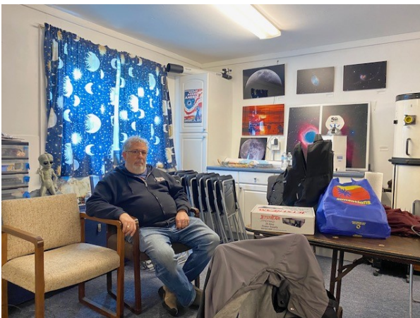
W1RAZ takes a break