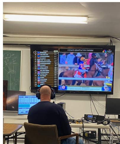
What to watch? The bands or the KY Derby?