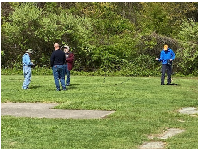
Antenna Set Up